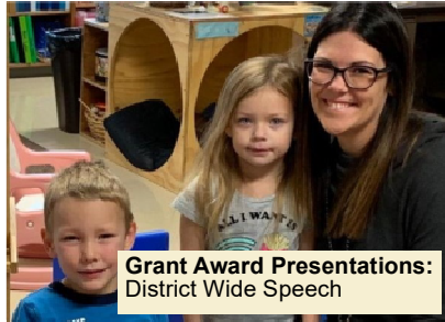
Grant Award Presentations: District Wide Speech

The Educational Foundation of Watertown, Inc. seeks to promote excellence in education through the use of its resources including, but not limited to the following: