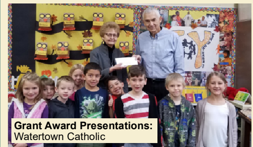
Grant Award Presentations: Watertown Catholic