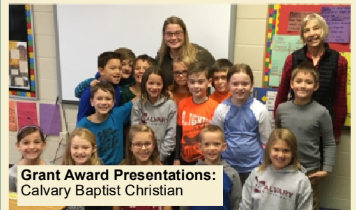
Grant Award Presentations: Calvary Baptist Christian