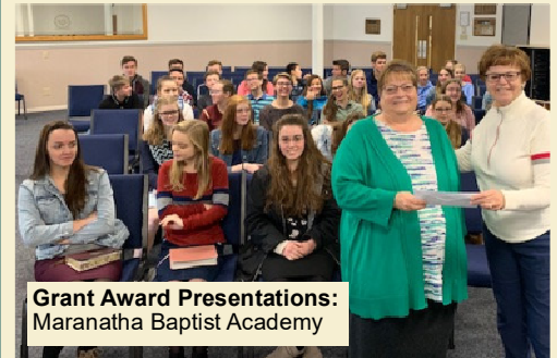
Grant Award Presentations: Maranatha Baptist Academy