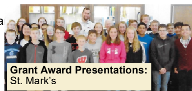
Grant Award Presentations: St. Mark's