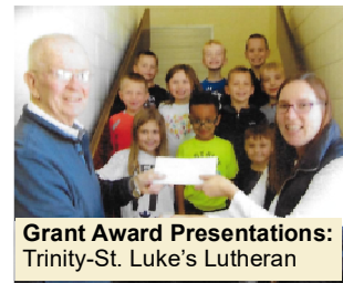
Grant Award Presentations: Trinity-St. Luke's Lutheran