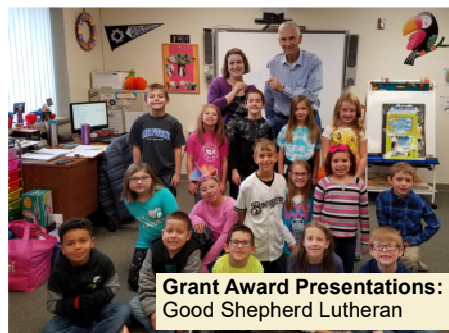
Grant Award Presentations: Good Shepherd Lutheran