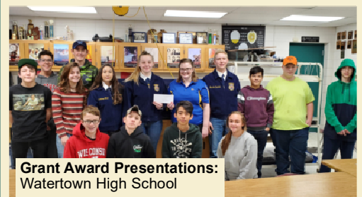
Grant Award Presentations: Watertown High School