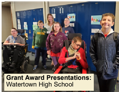
Grant Award Presentations: Watertown High School