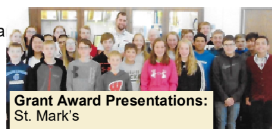
Grant Award Presentations: St. Mark's