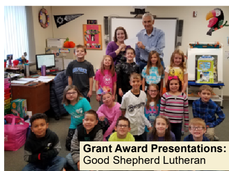
Grant Award Presentations: Good Shepherd Lutheran