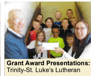
Grant Award Presentations: Trinity-St. Luke's Lutheran