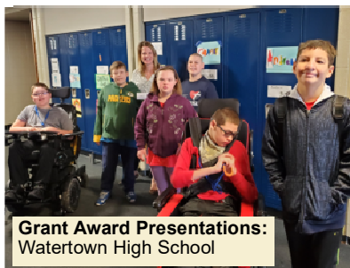
Grant Award Presentations: Watertown High School