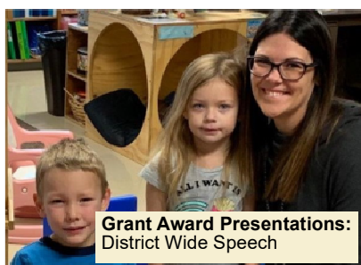
Grant Award Presentations: District Wide Speech