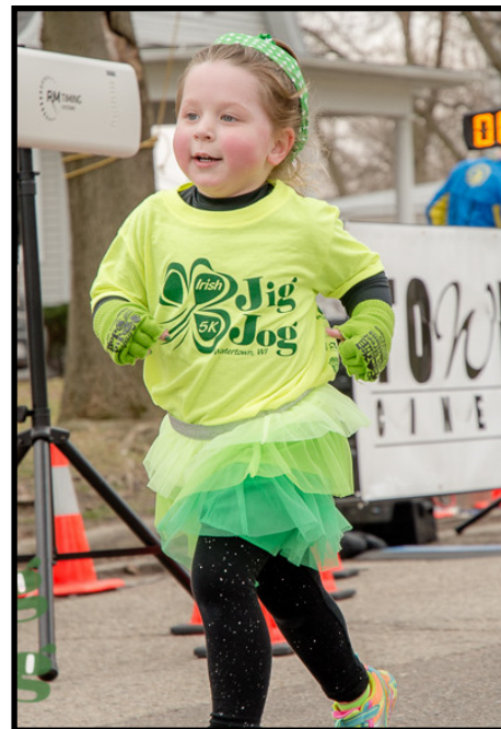
One of the over 400 Watertown Jig Jog participants

Educational Foundation of Watertown, Inc.