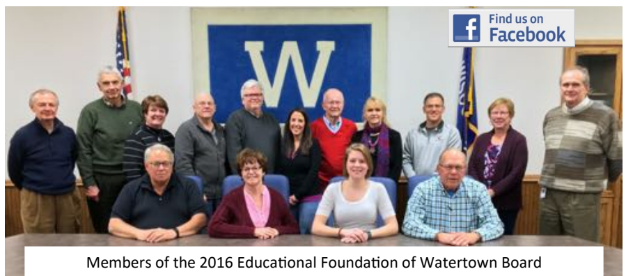
Members of the 2016 Educational Foundation of Watertown Board