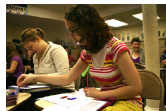
Students using Algebraic Bosse Tiles.

Provide . . . schools, students and teachers with financial support through grants and/or scholarships.