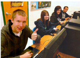
Drawing made in animation class by high school students using tablets purchased by Educational Foundation grants.